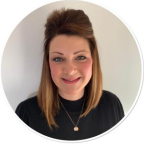
Early Years Lead Little Oaks Teacher