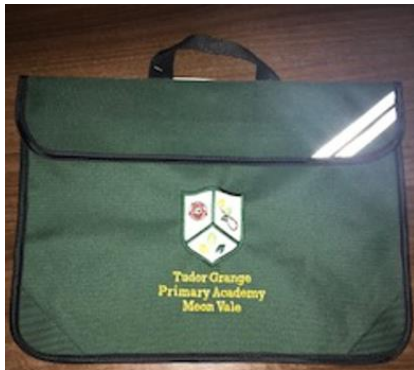
School logo Book Bag