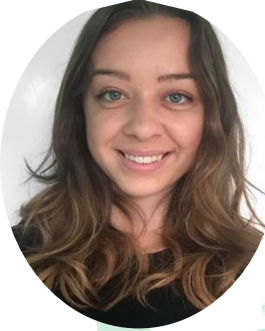
Class Teacher Willows Teacher